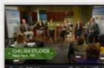
watch the New York Town Hall