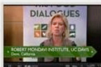
watch the California Town Hall