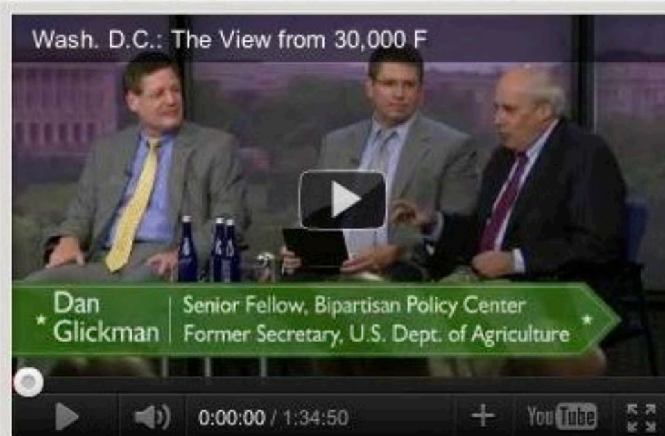
Washington, D.C. Town Hall

America's farmers and ranchers recently kicked off The Food Dialogues, the launch of a new effort to bring together different viewpoints on farming and ranching and the future of food. The recent Food Dialogues town-hall style webcast offers background information on various issues related to how food is grown and raised in America, while the Food Dialogues website is a destination where the online conversation continues. Missed the webcast? Click the videos on the right to see highlights.