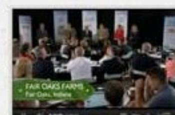
watch the Indiana Town Hall